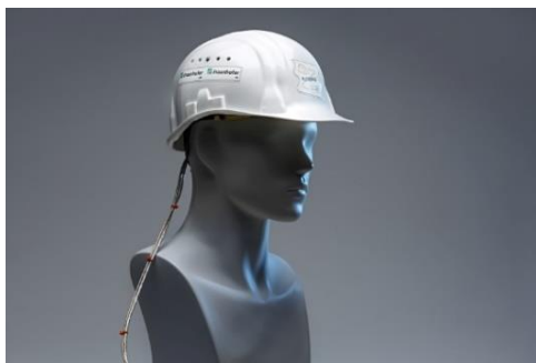
Figure 1: The piezo-electret transducer is inconspicuously integrated in the inner fastening strap of the helmet. The photo shows a demonstration model of the technology.