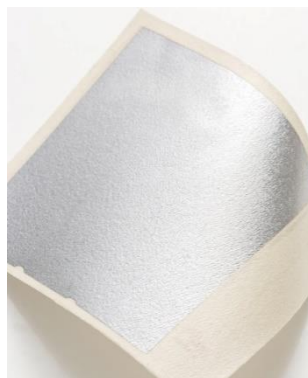
Figure 2: The piezo-electret film is foamed and coated with aluminum as a contact layer by means of vapor deposition. When it is deformed by acceleration forces exerted on it, it emits voltage that is recorded by the system as a signal.