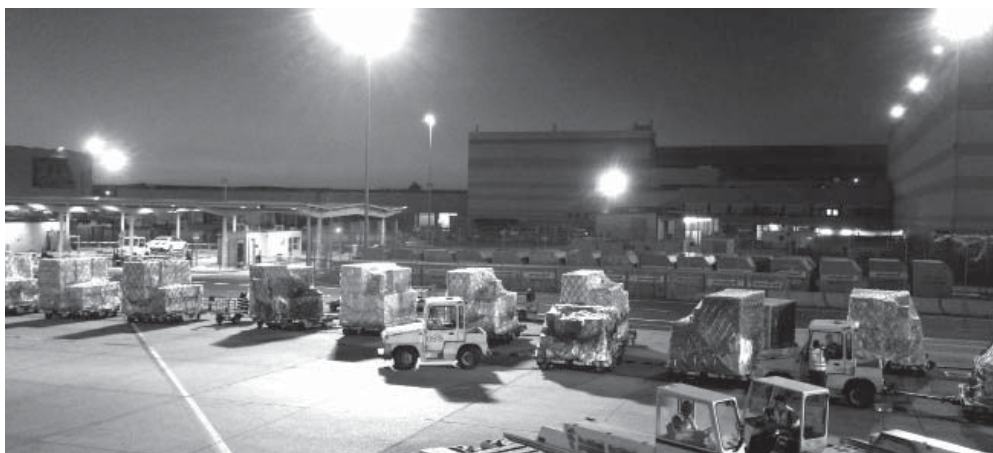
The positioning systems developed in the EU project e-Airport help control processes on airport aprons more efficiently.

The researchers will be presenting their e-Airport project at the BVL's International Supply Chain Conference in Berlin from October 28 to 30 (Booth P/24).