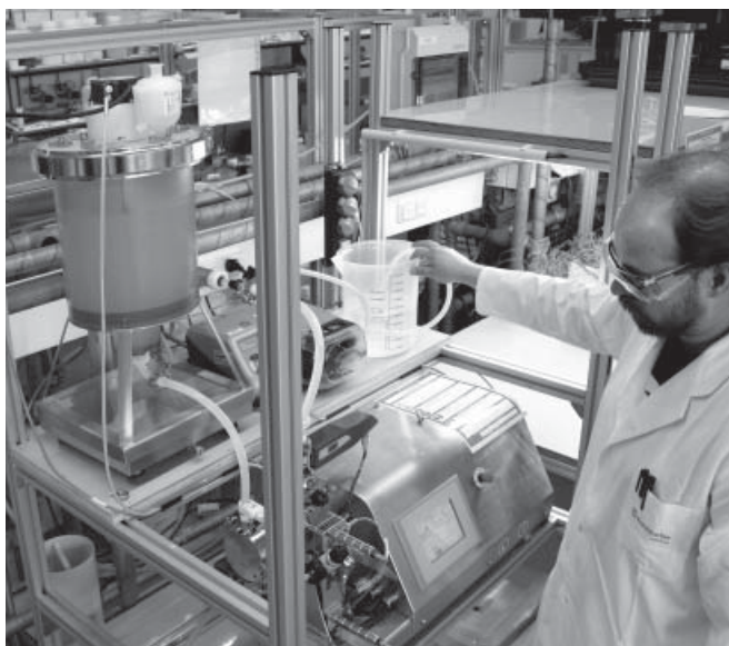
Peptides harvested from rice proteins are sorted by size using a special filtration technique. (© Fraunhofer UMSICHT) | Picture in color and printing quality: www.fraunhofer.de/press

At the end of the peptide production chain is an SME enterprise headquartered in Switzerland and Italy which will bring them to market. However, before reaching supermarket shelves as ingredients in creams and nutritional supplements, the peptides must still undergo a number of tests and analyses, primarily with regard to their tolerability and effectiveness.