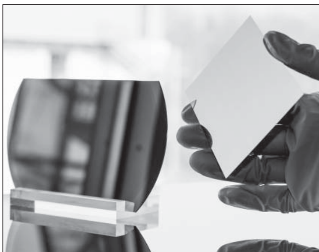
Wafers are detached during the new process (right), leaving the reusable substrate (left). © Fraunhofer ISE | Picture in color and printing quality: www.fraunhofer.de/ press

Further information: http://www.nexwafe.com/